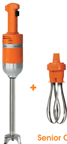
Senior COMBI 300

1 Motor block 1 Mixer tool Knife 1 Whisk tool Item code