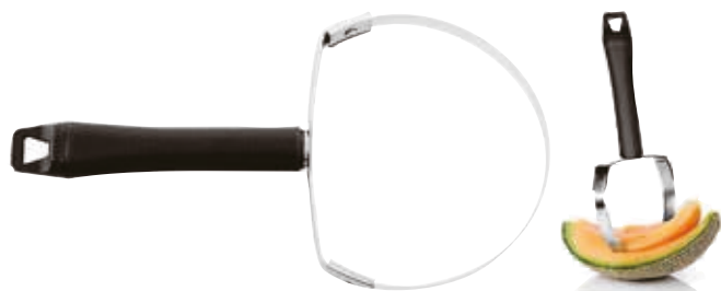
Melon peeler Sbuccia melone Melonenschäler Éplucheur à melon Pelador de melon