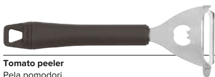
Tomato peeler Pela pomodori Tomatenschäler Éplucheur à tomates Pelador de tomates